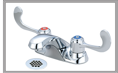
#3LG121G SHOWN * ADA