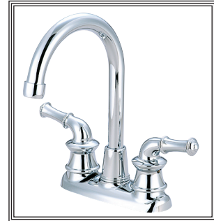
#5DM100 SHOWN * ADA